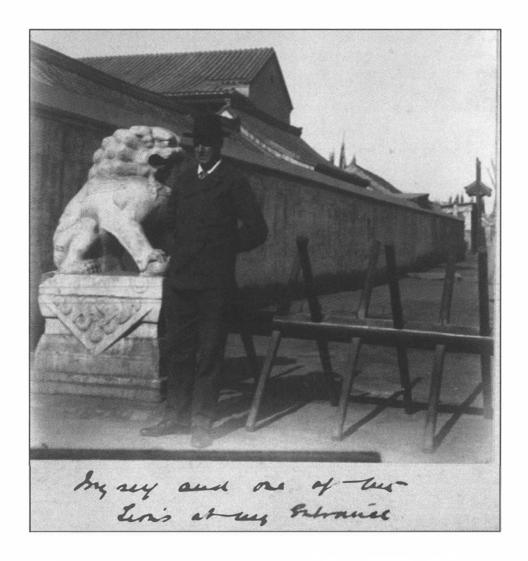
"Myself and one of two lions at my entrance"; Morrison outside bis bouse in Wangfu Jing